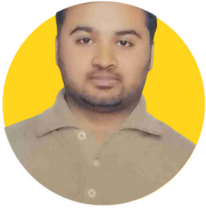
Yuvraj Singh WIPRO